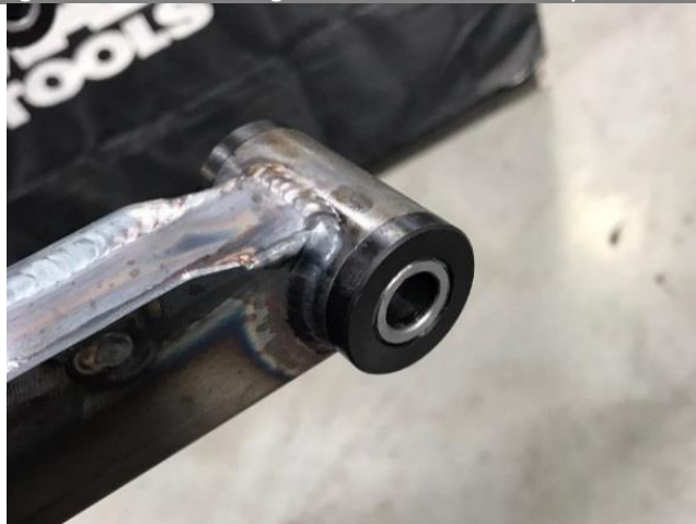
Figure 4: New bushings and crush sleeves in pivot tubes