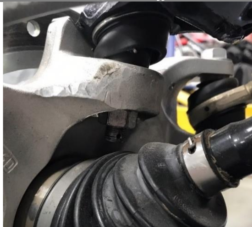
Figure 1: Remove nut and washer off bottom side of ball joint